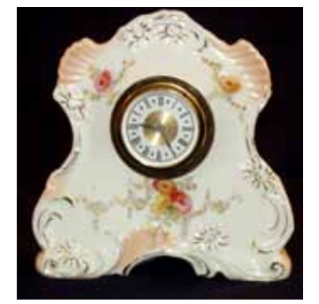
Dale Bowser's collection of red Prussia.