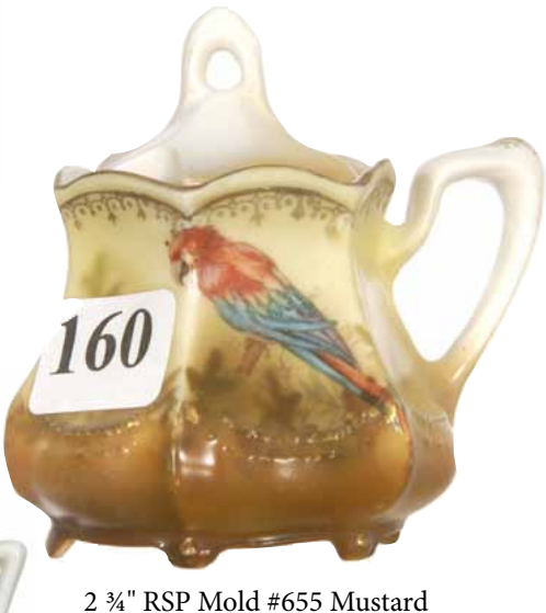
Iarbrown Tones With Parrot Décor $400