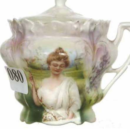
3 1/2" RSP Iris Mold Mustard Pot White and Green-Spring Season Portrait-Satin Finish $500