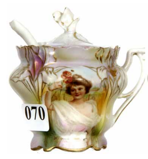
3 1/2" RSP Iris Mold Mustard Pot White and Lavender Satin Finish- Summer Season Portrait $500