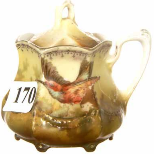
2 ¾" RSP Mold #655 Mustard Jar Brown Tones with Hummingbird Decor $600