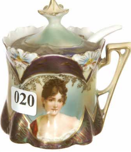
3 1/2" Unmarked Prussia Lily Mold Mustard Jar, Green Background with Decorated Tiffany Finish Border -Racamier Portrait (Lid Repair) $300