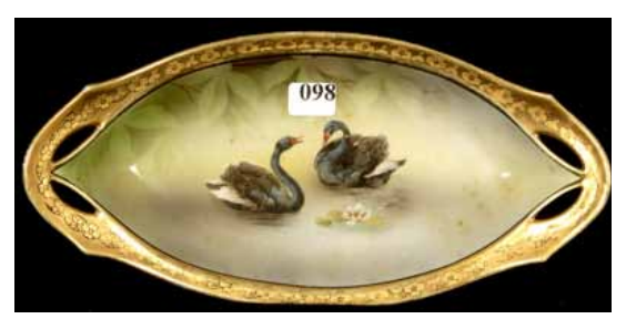
10 1/2" RS Tillowitz Celery Tray Black Swan Scenic Decor - Gold Trim $900