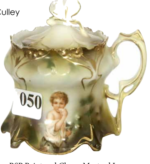
RSP Point and Clover Mustard Jar Green Tones with Melon Eater Decor (Finial Repair) $250